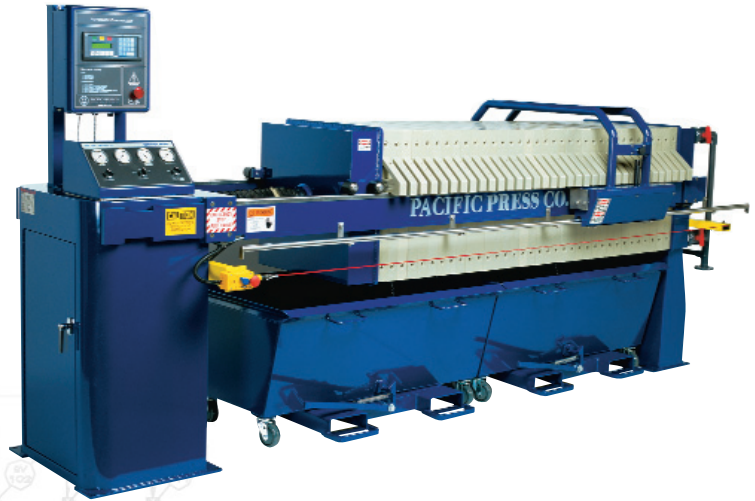
10 cu. ft. 630mm