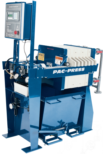
1 cu. ft. 470mm